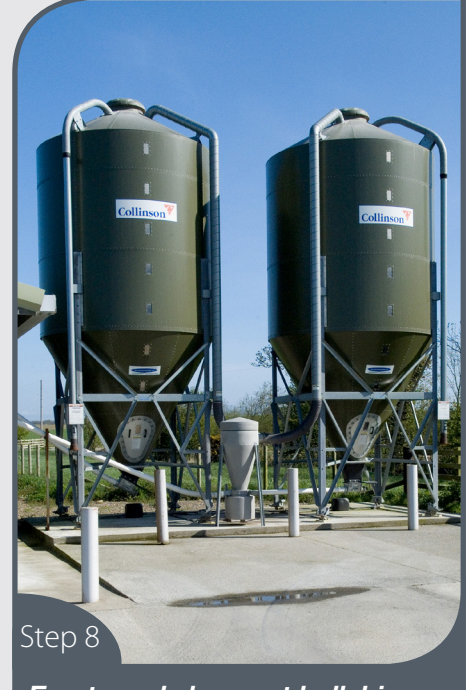
Empty and clean out bulk bins and connecting pipes

Where permitted, formalin fumigation should be completed by trained personnel, following local safety legislation and guidelines. Fumigate as soon as possible after disinfection; surfaces should be damp and the house warmed to a minimum of 21°C (70°F) and an RH of less than 65%. Seal the house for 24 hours (no entry permitted). Ventilate the house to reduce formalin levels to 2 ppm before entry to the house is permitted. Repeat fumigation after the litter has been spread.